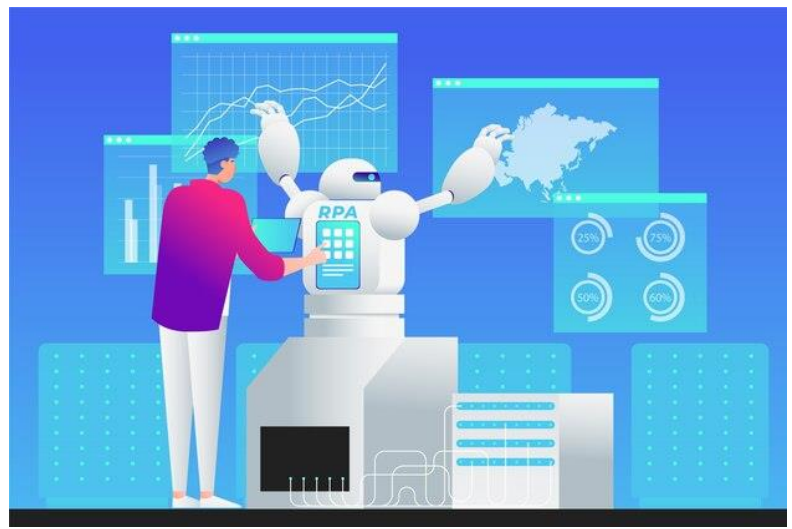
<ahref="https://www.freepik.com/vectors/ai-technology"> </a>

RPA technology is based on rules. The success of RPA is dependent on how well the bots are built. Bots are like the new employees on the team. The performance of a bot will depend on how well its rules have been 'written.' In this context, it becomes very important to understand the nuances of the single task or the entire process so that the bot can be trained effectively to navigate through the process.